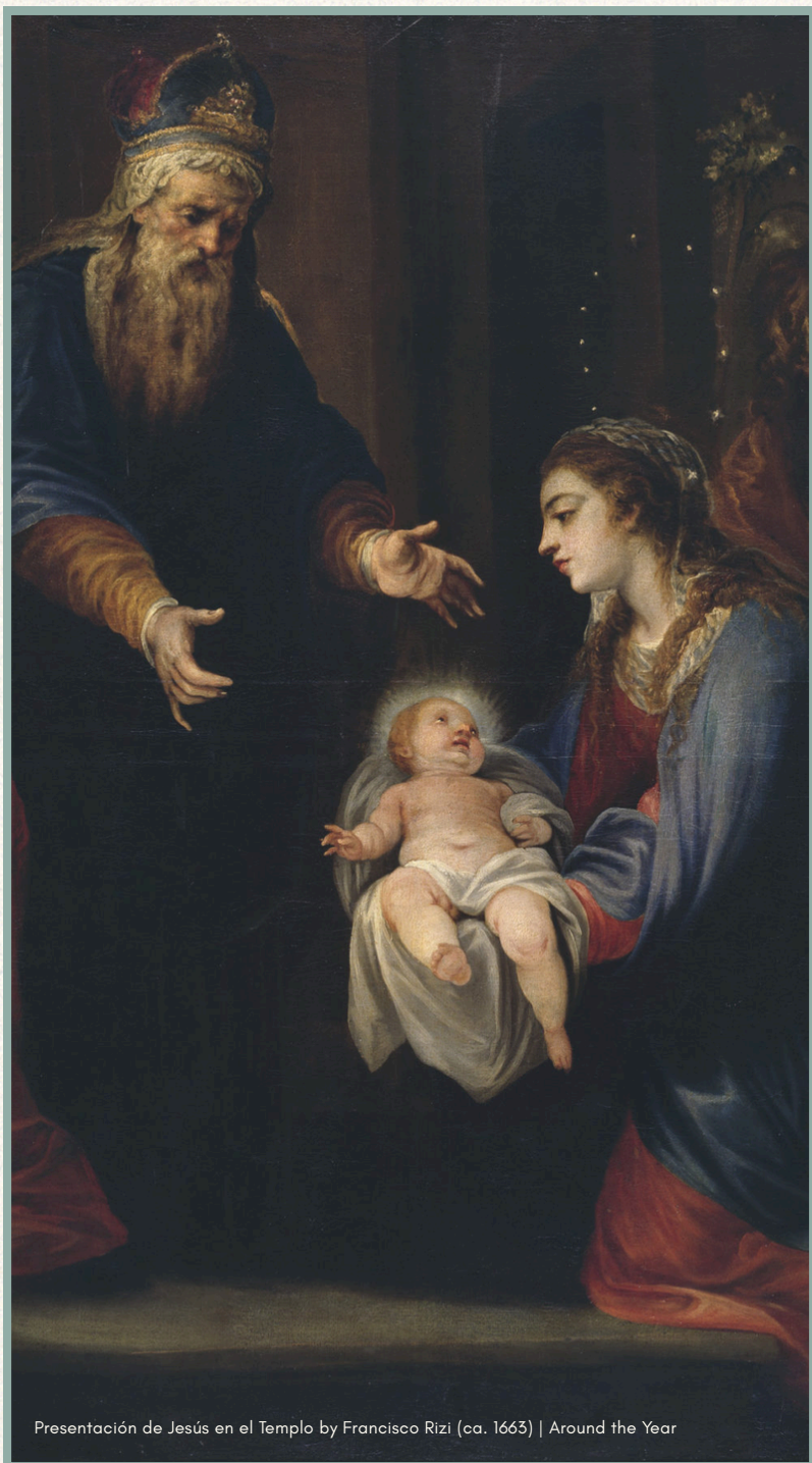
Presentación de Jesús en el Templo by Francisco Rizi (ca. 1663) | Around the Year

5633 HIGHWAY #7, MARKHAM, ONTARIO L3P 1B6 | PHONE: 905-294-5955 | WEBSITE: HTTPS://STPATRICK.ON.CA/